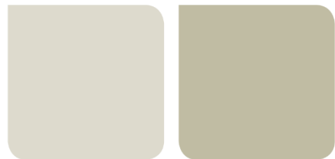
Surfmist® Evening Haze®