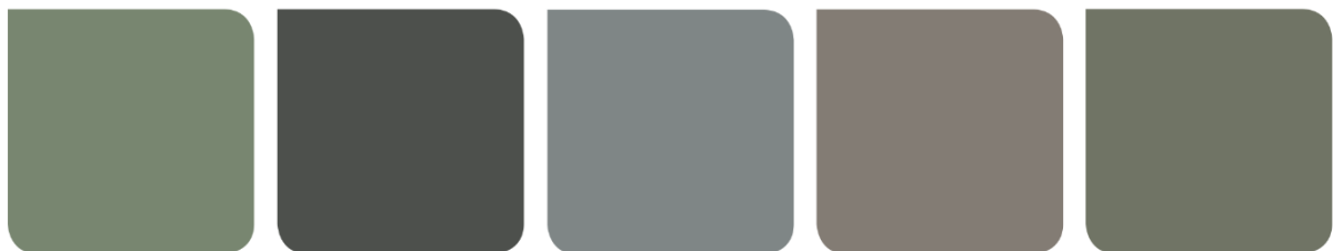
Pale Eucalypt® Woodland Grey® Windspray® Gully™ Mangrove™